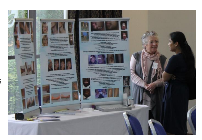
British Association of Skin Camouflage

This event has CPD accreditation and has a loyal following, with dermatologists attending each and every year. The next evidence based update event will be on hair disorders on 15 May 2019.